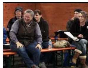
And a good time was had by all!

WAHA would like to thank the co-sponsors who helped make this clinic possible: Northern Illinois Arabian Horse Association, Lodi Vet Clinic/Madison Equine Clinic/Dr.'s Choice Supplements, and Blue Mounds Equine Center/Minitube of America! We have not previously attempted a clinic on this scale and are very pleased that it went smoothly and drew so many participants.