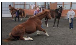
A good roll helps demonstrate a horse releasing its back.