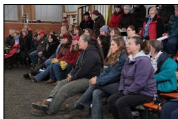
Everyone tunes in to a demonstration horse's example.