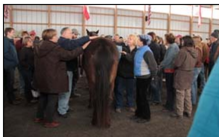
Attendees check out those concepts on their own, up close & personal, hands-on

Attendees also provided a range of experience and perspectives. The clinic drew folks from Wisconsin, Minnesota, Illinois, Iowa, and Michigan along with one person who came from Virginia. They included a range of amateurs and trainers with interests ranging from traditional show ring disciplines and dressage, to pleasure riding, distance riding, polo, driving, and others. Professionals such as vets, farriers, massage therapists, and chiropractors added other points of view.