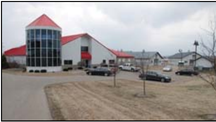
The host facility, Blue Mounds Equine Center and Minitube of America