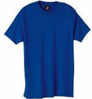
Sizes available S-XXXL $16.00