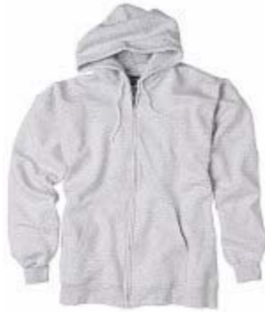
Sizes available S-XXXL $35.00