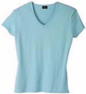
Sizes available S-XXL $ 16.00