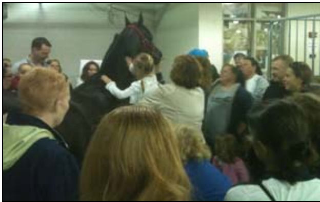
The black stallion Tuxedo Thyme ABA enjoys meeting a group of fans.