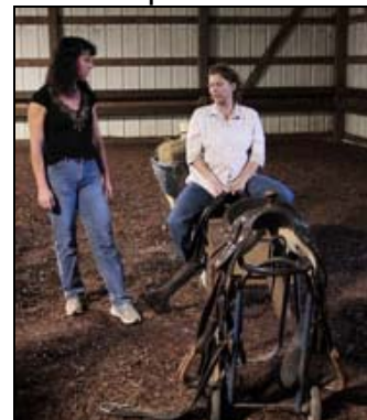
Getting a feel for the English cutback saddle.