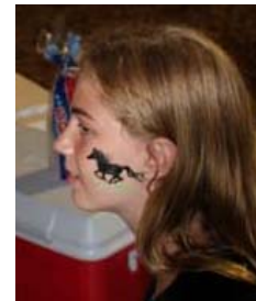
And the results!

We were able to gear the program for each group to their experience level. The first two groups were virtual newcomers to horses and horsemanship, so we spent a lot of time going over basic safety considerations, basic care, and Arabian breed characteristics.