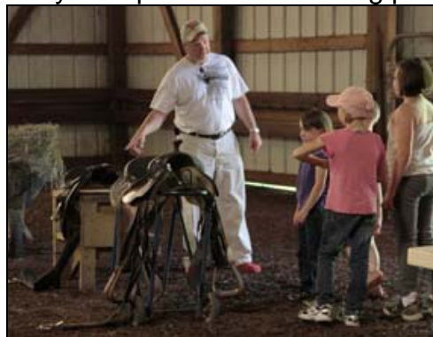
A visitor points out differences between the Western & English.