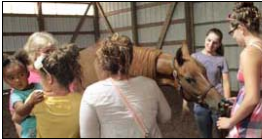
Everyone loves meeting the horses up close & personal, and the horses love it too! For sure, Sohpreme Design DHA (a.k.a. "Sobe") does!

But did you know that an individual farm can also host a TAIL program, and that this can be a great way to stimulate local interest in your community?